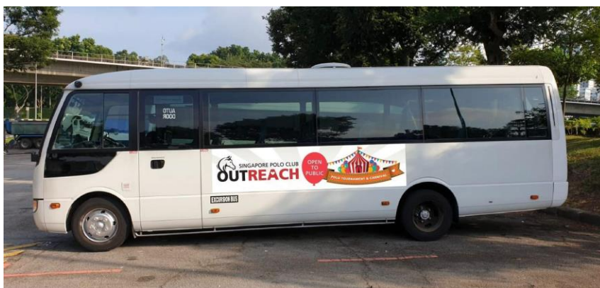
SPC Outreach Shuttle Bus

Yes, a complimentary two-way shuttle service will be available on the event day. It will run between Novena MRT and the Singapore Polo Club from 9.30am to 5.30pm. Pick-up point is at Royal Square Medical Centre, next to Courtyard by Marriott Novena, along Irrawaddy Road